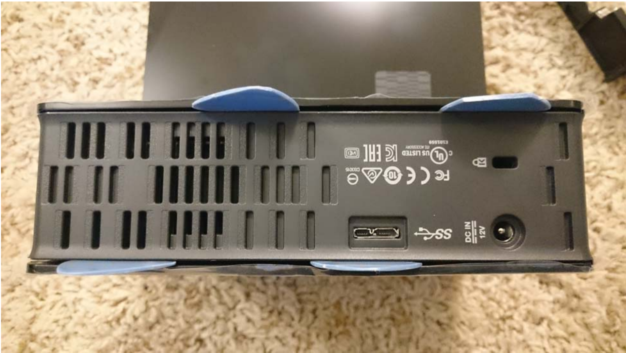
Use a discarded credit card (cut into pieces) or similar. Insert your flat plastic pieces onto the groove of each clip. Make sure you push as much as possible on each so it reaches the clip's base. Notice the clips are located staggered.