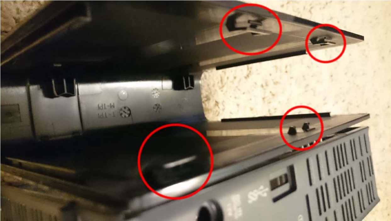
Photo reference. There are 4 clips on the DC IN/USB side (refer to as the back side). The top and bottom side of the case have a railing on each side that the body holding the hard drive will eventually slide out of the case.

WARNING: Do this at your own risk to your product and warranty! I am not liable and take no responsibility for your actions within.