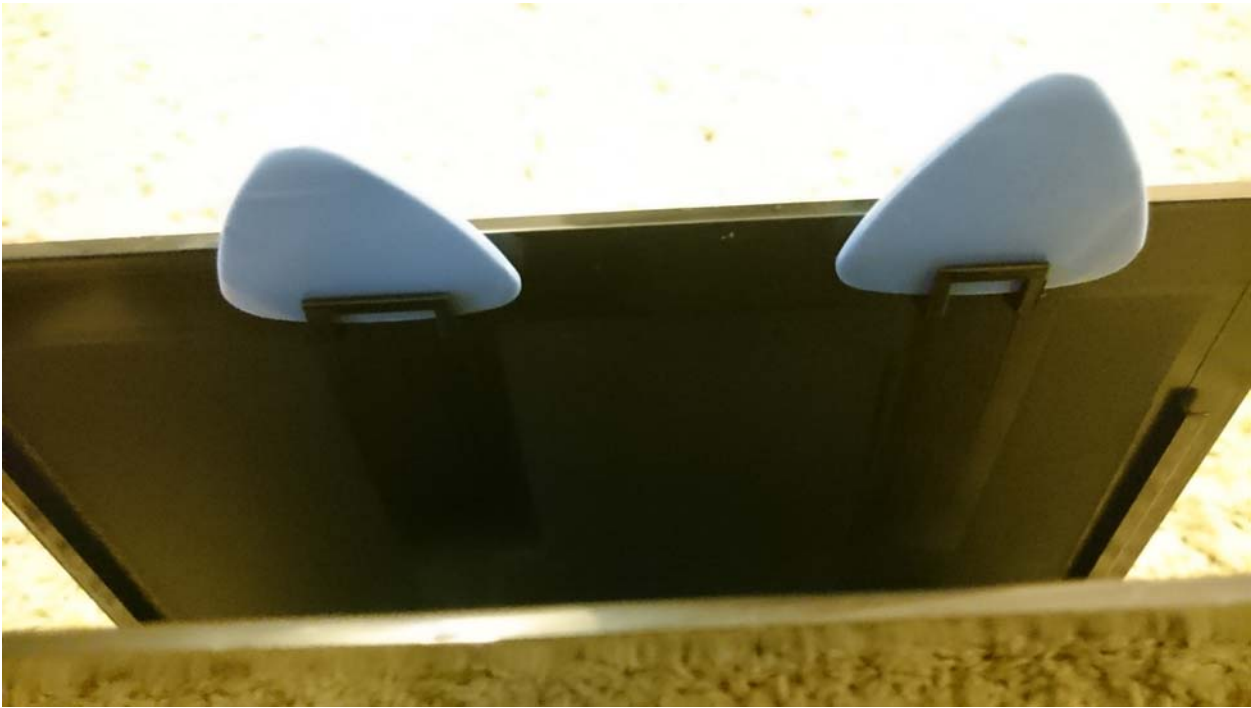
Photo reference. The photo above demonstrates how the card will be inserted—what it looks like from the inside.